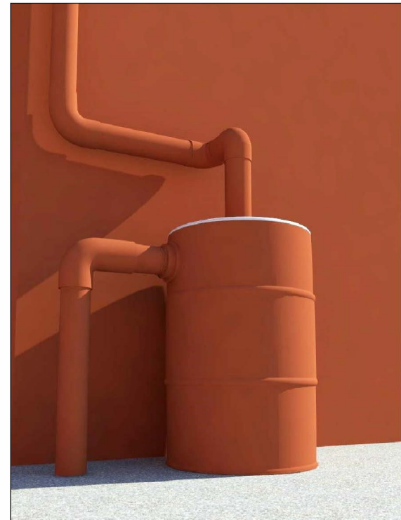
RENDERED T102 RAIN BARREL SCALE: NTS